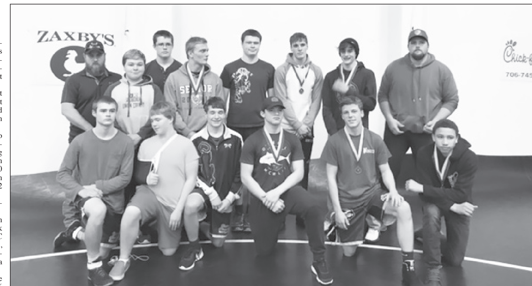
Union County wrestlers following their third place finish at the Panther Invitational on Dec. 16.

Area Duals will take place next weekend, Jan. 5-6